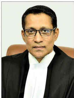
Hon. JUSTICE BECHU KURIAN THOMAS